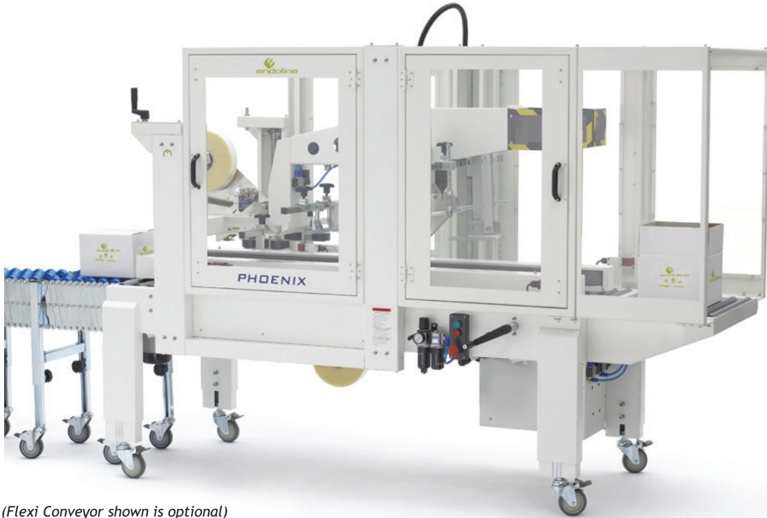
(Flexi Conveyor shown is optional)

Suitable for operator-free control, this machine includes a top flap closing unit, two tapeheads for top and bottom sealing, interchangeable tapeheads, adjustable legs, adjustable side squeeze wheels, locking castors and fully interlocked guarding as standard.