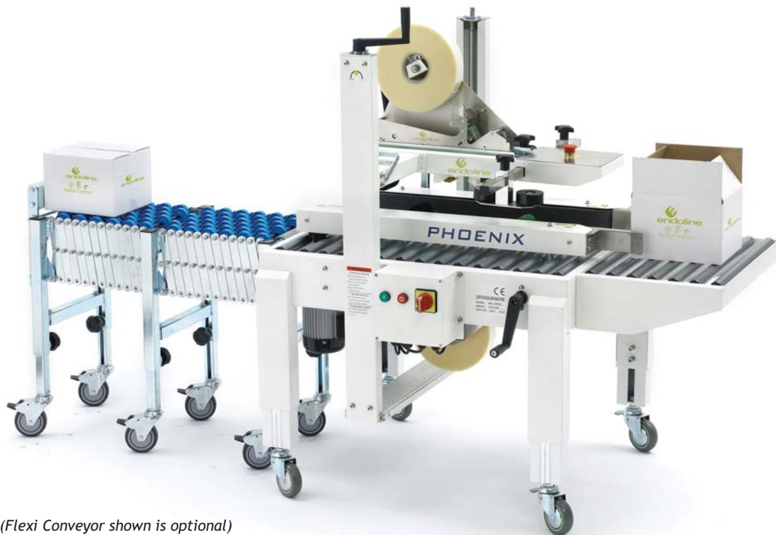
(Flexi Conveyor shown is optional)

Suitable for single operator packing and sealing of cases that are consistent in size, this machine includes an infeed packing table, floating bridge, locking castors, interchangeable tapeheads and adjustable legs as standard.